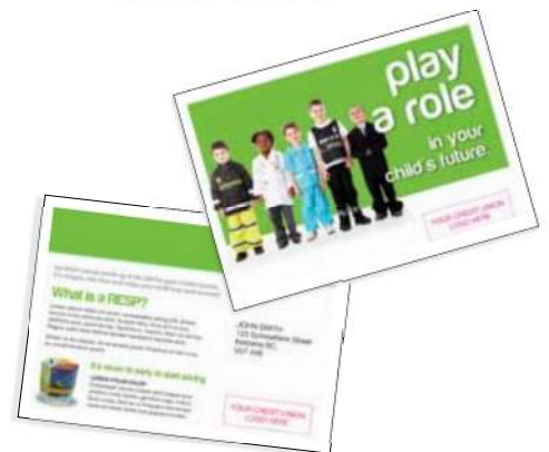
Postcard: 5" x 7"

Central 1 Credit Union Marketing & Creative Services central1marketing.com marketing@central1.com