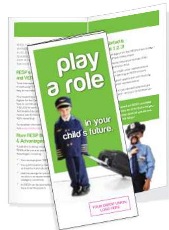
2-Panel Brochure folds to: 4" x 9"